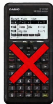
CASIO Graphing Calculator