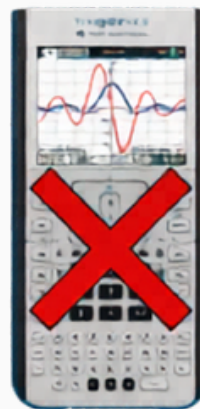
TI-Nspire CX II