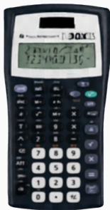
Scientific (e.g., TI-30X IIS)