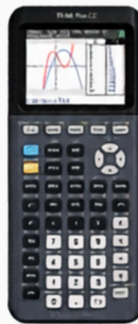
TI-84 Plus CE